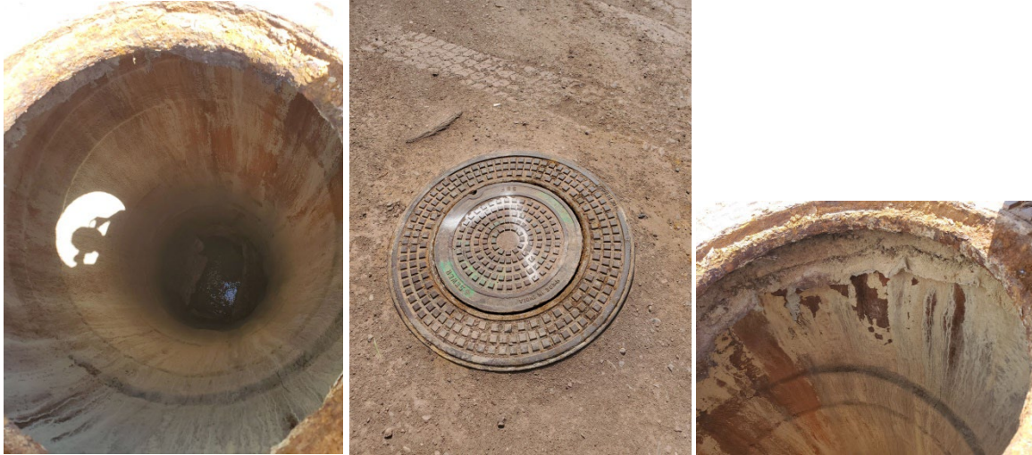
Depth- 20ft Bottom of liner is gone, collar is deteriorating