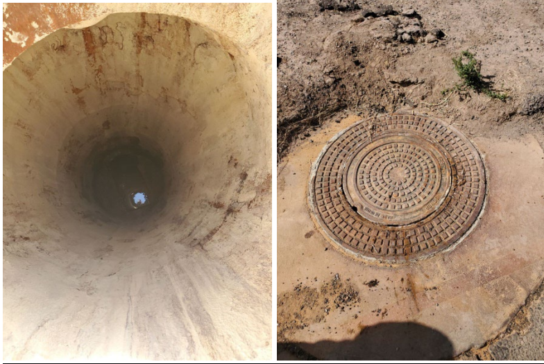
Depth- 21ft Bubbling in liner and missing liner at the bottom