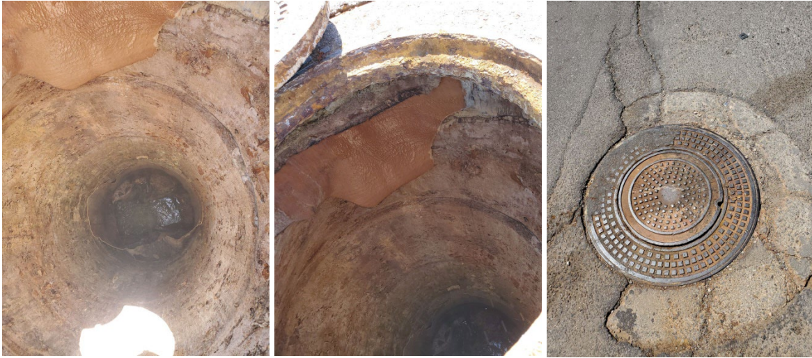
Depth- 16ft Complete liner failure, disrupting flow. Collar and concrete deteriorating.