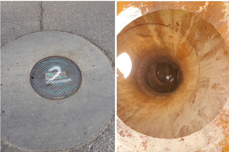
Depth- 17ft Bottom of liner is gone and disrupting flow