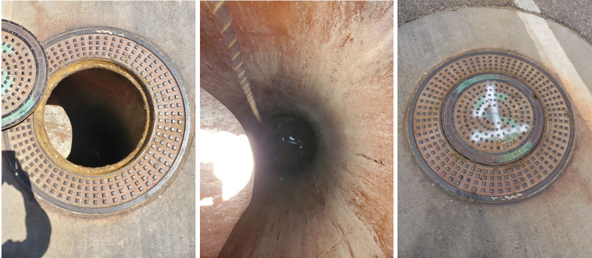
Depth- 17ft Bubbling in liner/ bottom liner is gone and disrupting flow