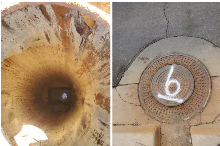
Depth- 17ft Liner bubbling and deteriorating