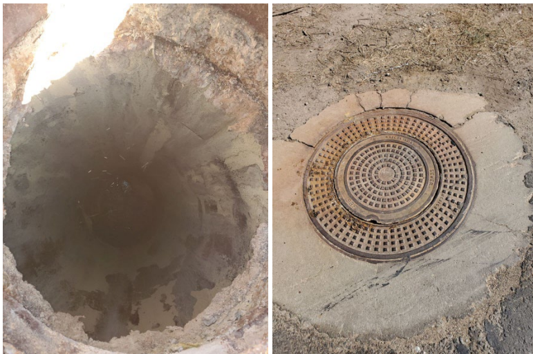
Depth- 22ft liner is deteriorating and a lot of corrosion from gases. (Entrance to Regional Lift Station)