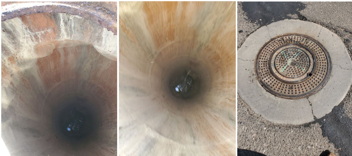
Depth- 21ft Bubbling in liner, bottom of liner is gone